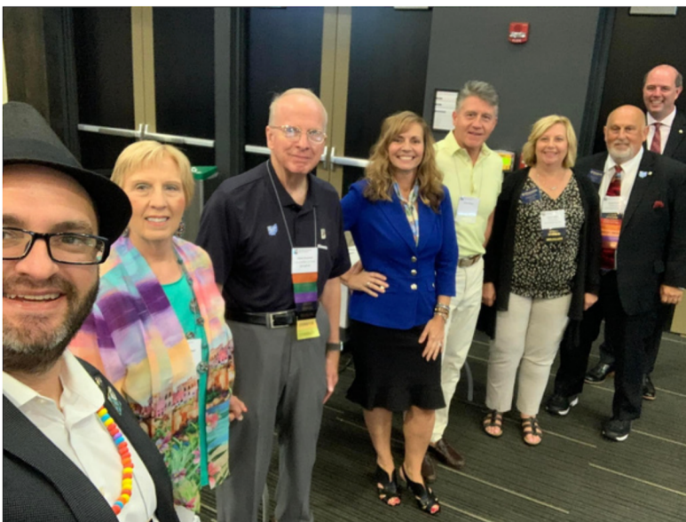
105th Ohio DCON held on 11-13 August 2023