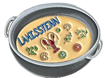
Louisiana-Mississippi-West Tennessee District