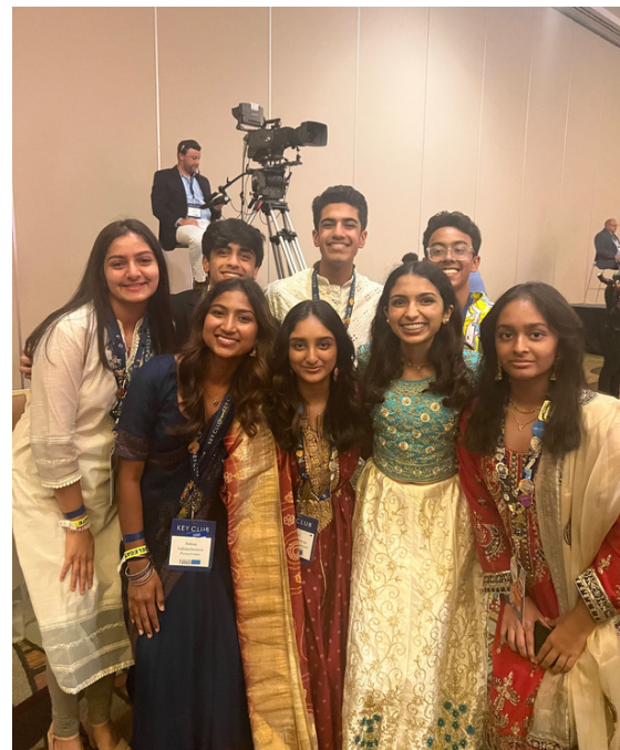
Cultural Night with Key Clubbers from the Florida, Illinois-Eastern Iowa, Kentucky-Tennessee, and Pennsylvania Districts