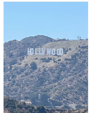
The Hollywood Sign