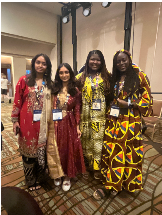
LaMissTenn Key Clubbers on Cultural Night

Two weeks ago, the LaMissTenn Key Club District Board had the fantastic opportunity to attend the Key Club International Convention (ICON)! Key Clubbers from around the United States and the world were invited to participate in this grand event. With many different attendees of diverse backgrounds such as Jamaica and Canada, Key Clubbers had the opportunity to meet with like-minded individuals that provided a new and unique perspective on what Key Club means to them. On the second night of ICON, Key Clubbers were encouraged to wear clothes that represent their culture. A few of the LaMissTenn Key Clubbers did represent their culture in their outfits as shown in the pictures below. It was great seeing everyone representing their cultures and the diversity of Key Club International! Even though we may all come from different backgrounds, states, or countries, ICON reminded us that we all share the same goals and objectives. It's important to promote and retain Diversity, Equity, and Inclusion (DEI) Principles across our District and within our clubs to continue the unity of Key Club members across all levels.