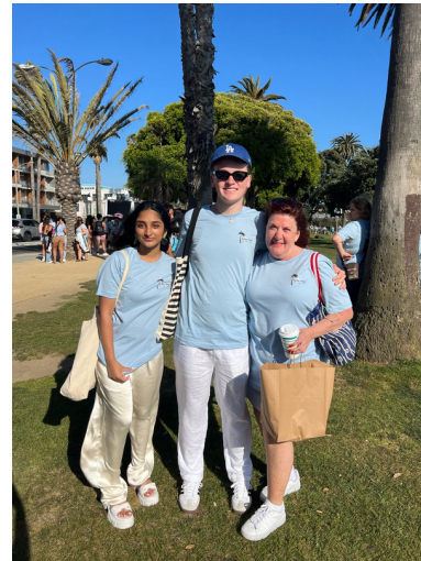
The Executive Board