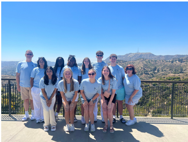
LaMissTenn at Griffith Observatory

On July 5, the LaMissTenn Key Club District embarked on a bus tour around Los Angeles with ten other Districts. Our first stop was Hollywood Boulevard, where we saw the Stars of ICONS along the Walk of Fame. Then, we hopped back on our bus and drove to the Los Angeles Farmer’s Market and a cool shopping spot called The Grove for lunch! Afterwards, our tour continued with a drive to the stunning Griffith Observatory, with unparalleled views of the Hollywood Sign and Los Angeles. It was amazing! On our last stop, we walked along the famous Santa Monica Pier and Beach. It was cold, but some of us even swam in the Pacific Ocean! This bus tour was truly incredible, and we all loved being tourists for the day.