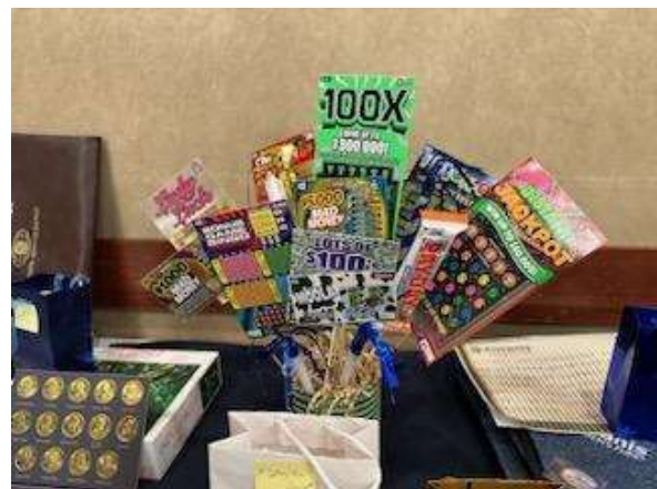
One item on the Raffle Table