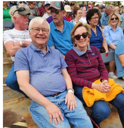
Food and drink were available ...