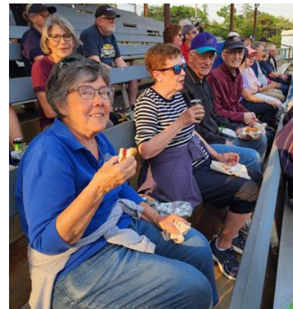
And a good time was had by all !