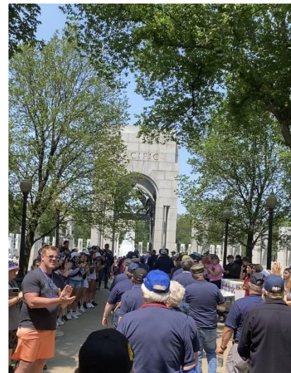
Students lining up to welcome us at the WW2 Memorial

Our first stop was the WW2 Memorial where we would be conducting a Wreath Laying Ceremony. It was the first of many to come. Our organizers said this was the first time they had no WW2 Vets. As we formed up to proceed into the Memorial, we experienced another first. School aged children, from all over