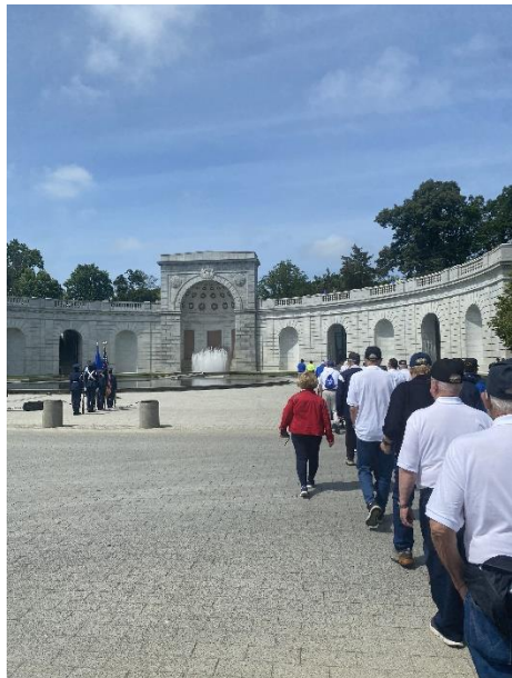
Our Veterans proceeding into the Military Women's Memorial

We were winding down our tour of memorials now but had two more stops ahead of us, one everybody was looking forward to. For that we went back to Arlington to visit the Tomb of the Unknown Soldier. We all received the mandatory briefing of how to approach, to keep silent and, to show respect to the unnamed soldiers represented. It was also a sign of respect to the solemn duty and drills of the soldiers guarding the Tomb. We had arranged