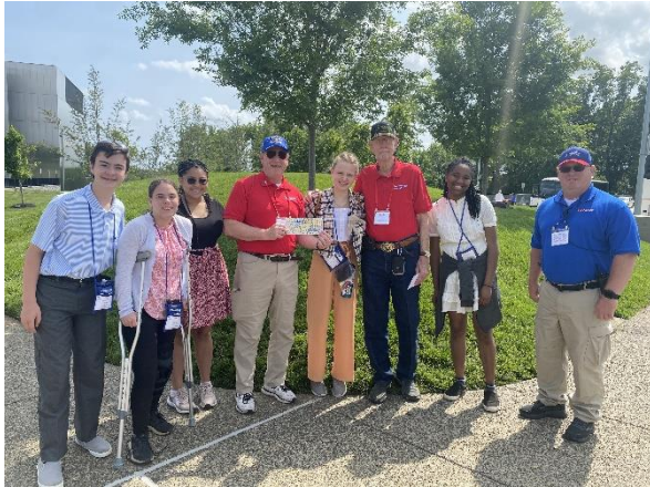
Students expressing "Thanks for your Service" to Veterans

they made up far and away the most veterans present. We spent a long time at the Memorial Wall, and many were assisted in their search for the names of friends and loved ones who did not return. From the Vietnam Memorial we made our way up to the Lincoln Memorial where we had an hour or so to tour around. We were amazed by a group of students on a field trip from Ohio when they passed word through their teachers/tour guides that they wanted to express their gratitude. They all lined up and we enjoyed going through the line. Their sincere expressions of “Thanks for your Service” were warmly received.