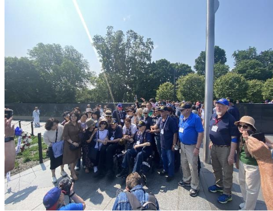
South Korean Tourists expressing Gratitude at the Korean War Memorial

Next was the Korean War memorial and the most amazing experience. We had 4 Korean War vets and planned a wreath laying ceremony to honor those lost during the Korean War. We formed up to march up to the memorial and as we proceeded up the path, a group of South Korean tourists stopped to let us pass by. They followed us up and lined up against the memorial wall as we conducted the ceremony which consists of laying the wreath and playing taps. The wreath placing ceremony is a very moving moment. The wreath is placed by the veterans of that war and then a moment of silence followed by the playing of taps on the bugle. The veterans involved are moved because of the memories and friends lost during the conflict. This has a profound effect on all present. The Korean tourists began to move forward to express their gratitude to the vets for the sacrifices that allow them to live free to this day. There were deep expressions of gratitude and no dry eyes in the crowd.