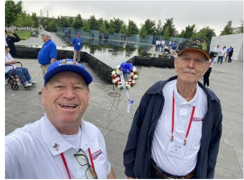
American Veterans Disabled for Life Memorial