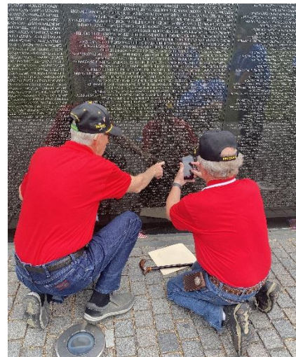
Dad locating the name of a fallen comrade at the Vietnam Memorial

May 19 th began with a wonderful breakfast followed by the bus trip to Arlington Cemetery for another Wreath Laying Ceremony. We then had the opportunity to explore around the cemetery. From there we proceeded to the Vietnam War Memorial, where yet another Wreath Laying Ceremony was conducted. It is important to remember and realize, for each of these Wreath Laying Ceremonies, there are different people involved and different experiences recalled. They are all meaningful and profound as those involved are supported by all of us. These ceremonies often bring back difficult memories and feelings. We had many Vietnam Veterans in our group, and