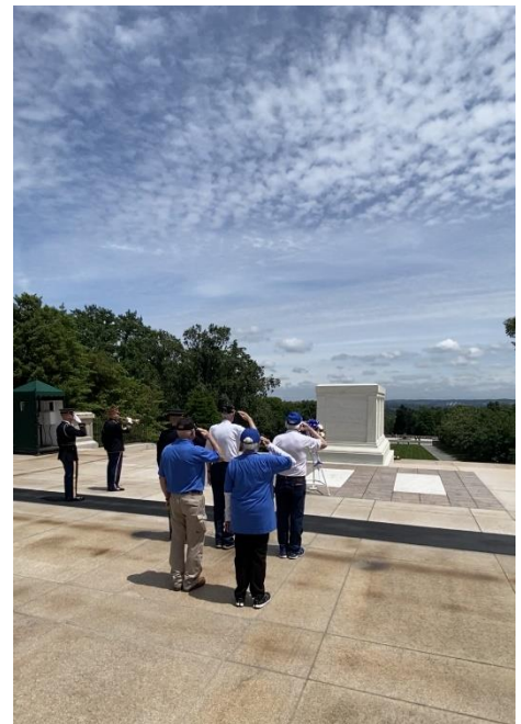
Dad (forward left, white shirt) Saluting the Tomb of the Unknown Soldier during the Wreath Laying Ceremony while Taps is Played

We were winding down our tour of memorials now but had two more stops ahead of us, one everybody was looking forward to. For that we went back to Arlington to visit the Tomb of the Unknown Soldier. We all received the mandatory briefing of how to approach, to keep silent and, to show respect to the unnamed soldiers represented. It was also a sign of respect to the solemn duty and drills of the soldiers guarding the Tomb. We had arranged