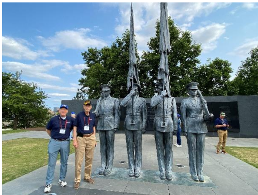
Dad and I at the USAF Memorial

The Air Force Memorial was special for us as we both served in the USAF. Dad was an Intelligence Officer and spent his whole career devoted to the USAF and our Country. He later became Director level manager at the Air Force's Intel School when it moved from Lowery AFB in Colorado to Goodfellow AFB in San Angelo, TX.