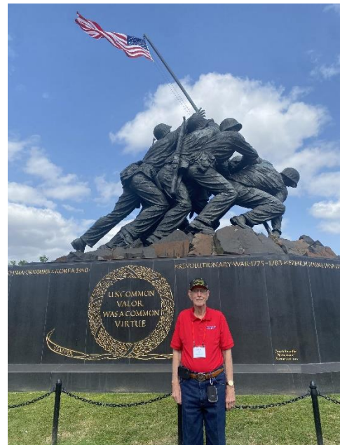
Dad at the Marine Memorial

Our last day in Washington DC, May 20 th , started at the American Veterans Disabled for Life Memorial. We also had a Wreath Laying Ceremony here for the Veterans who carry the heavy load of their service to our country. This is a load which is sometimes seen, yet many times unseen. We were treated to a beautiful vocalization of the opening lines to God Bless America and then we all joined in the chorus we know so well. Truly a moving moment.