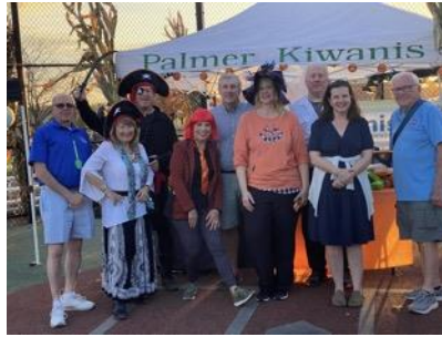
Easton and Palmer Kiwanis, Easton Rotary