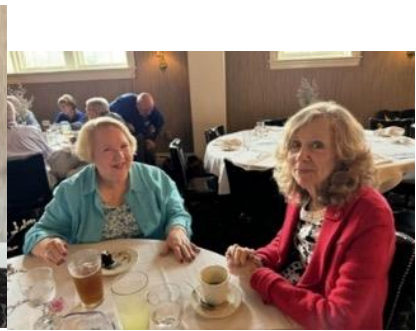
From an Interview which aired on WFMZ